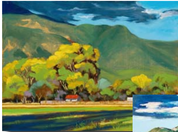
"Don't Fence Me In" Oil 9 x 12

"I cannot tell you how much I enjoyed your workshop. I learned so much that my head is spinning... I have been painting for 20+ years and heard information that was new!" New Mexico artist