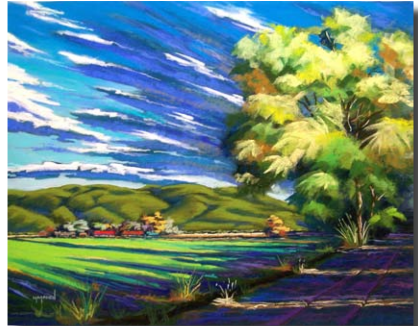
"El Prado, Taos" Pastel 11 x 14